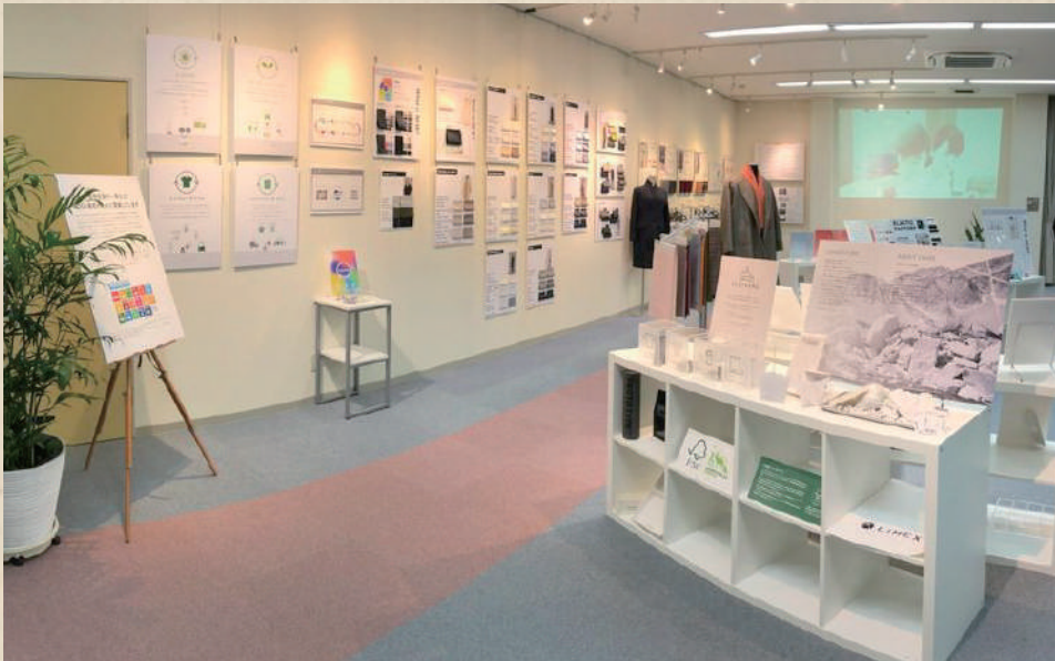
The entrance of the conference room: You can overlook the Dye Works from the window in the back on the right.

Do you know about a show room at Mikuni production base? We have an exhibition corner for Sankei products at a conference room on the second floor at Mikuni Dye Works, the first place to let our customers in. The factory profile is explained first, then customers can actually touch displayed products at the exhibition corner before going a factory tour. Over 50 companies visit to Mikuni every year, and some partners having Mikuni factory tour as one of their employee training. Mikuni show room which can be a portal for Sankei. To get Sankei's environmental activities noticed, the lineup has been updated with RENU, eco-friendly liner, labels, CLOTHERE, LIMEX and so on.