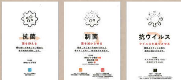
Antibacterial processing Bacteriostatic processing Antivirus processing